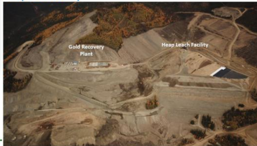
Heap Leach Facility