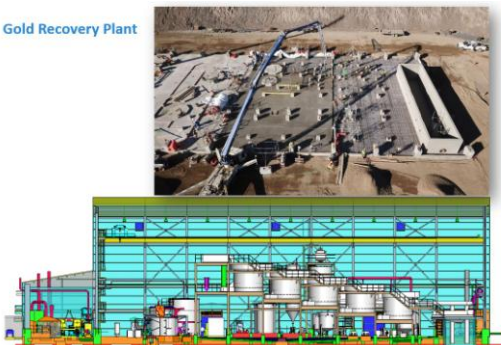
Gold Recovery Plant