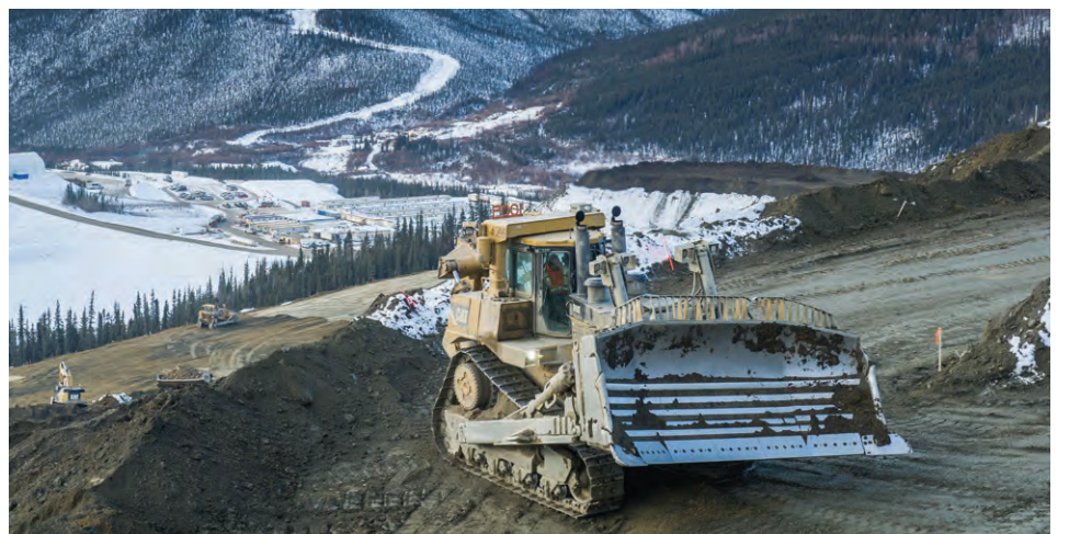
Pelly Construction during the construction of Victoria Gold's Eagle Gold Mine.