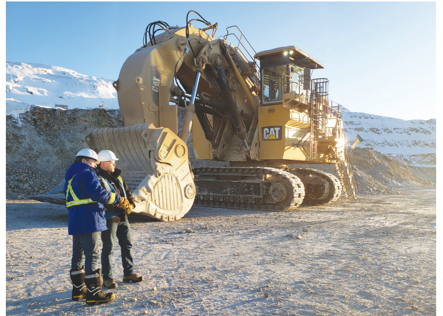
Tour to oversee operations in the Eagle Gold Mine pit.