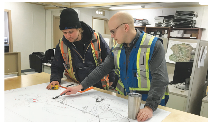
Reviewing drill and blast designs with a Victoria Gold team member.